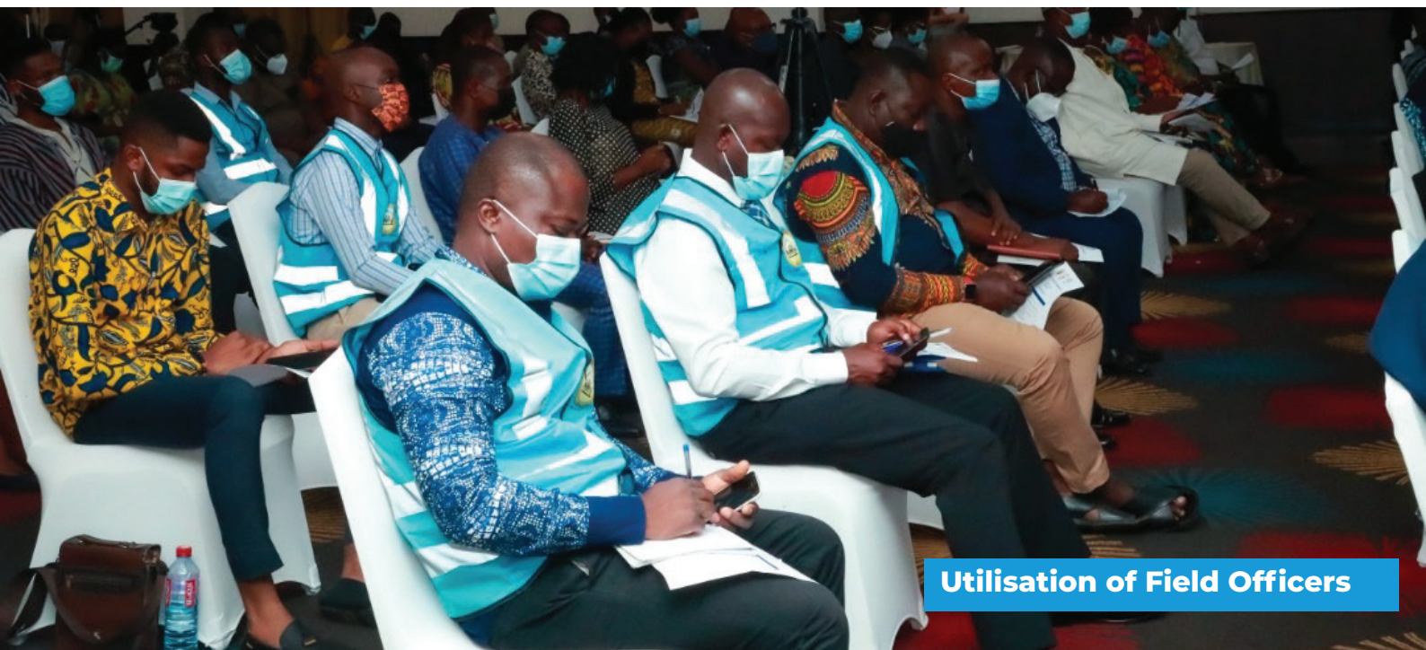
Utilisation of Field Officers

As part of the PEA campaign, a delegation from the Ghana Statistical Service led by the Government Statistician completed nationwide tours to visit all regions in the country ahead of the start of the Census exercise. The purpose of these regional visits, which was to officially hand over the responsibility for successful Census implementation to the Regional Coordinating Councils, included a courtesy call on the Regional Ministers and information sessions with the Regional Census Implementation Committees, Heads of Departments and key regional stakeholders.